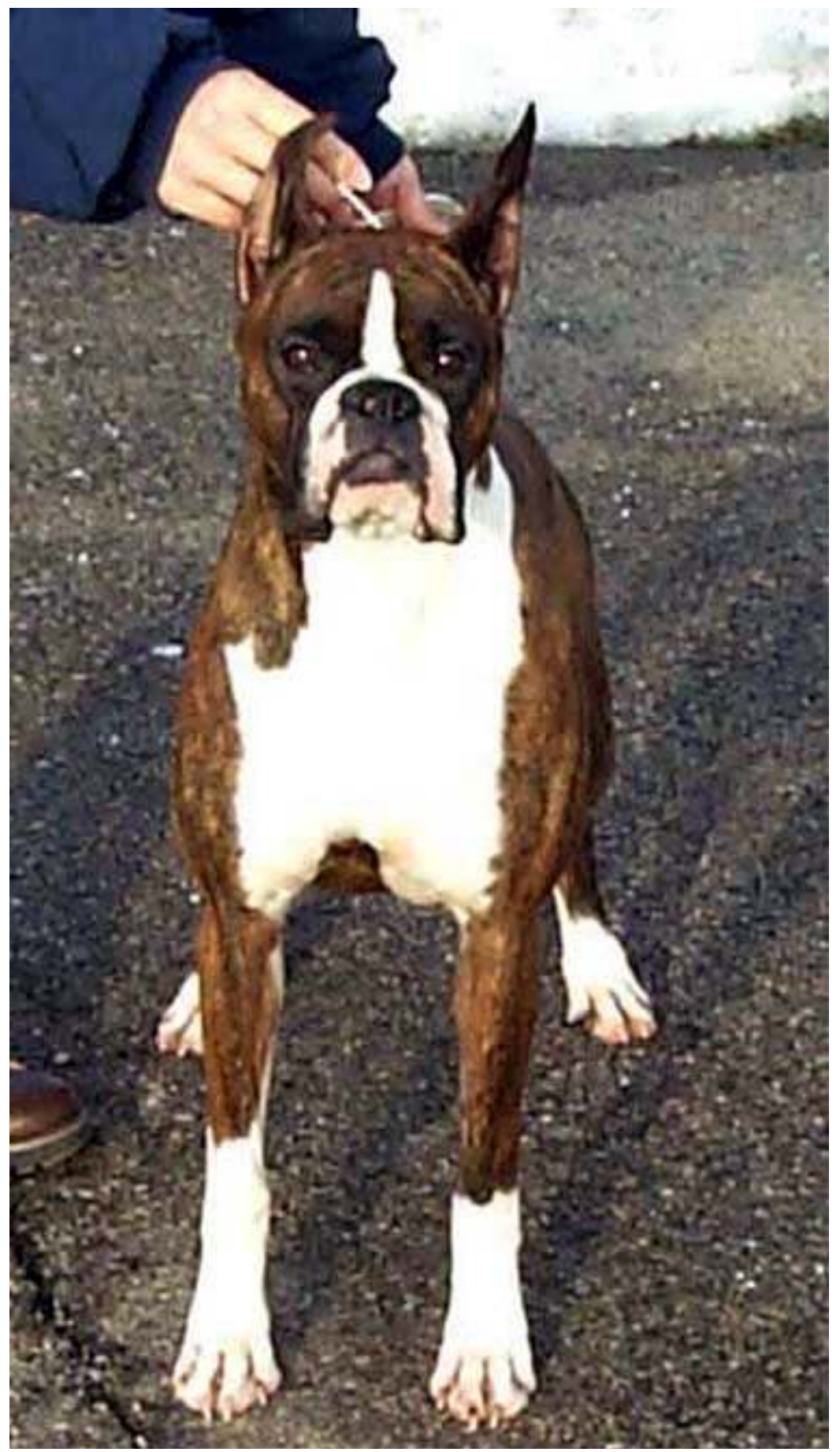
Per diagram on page 1 - Green & blue lines are off.