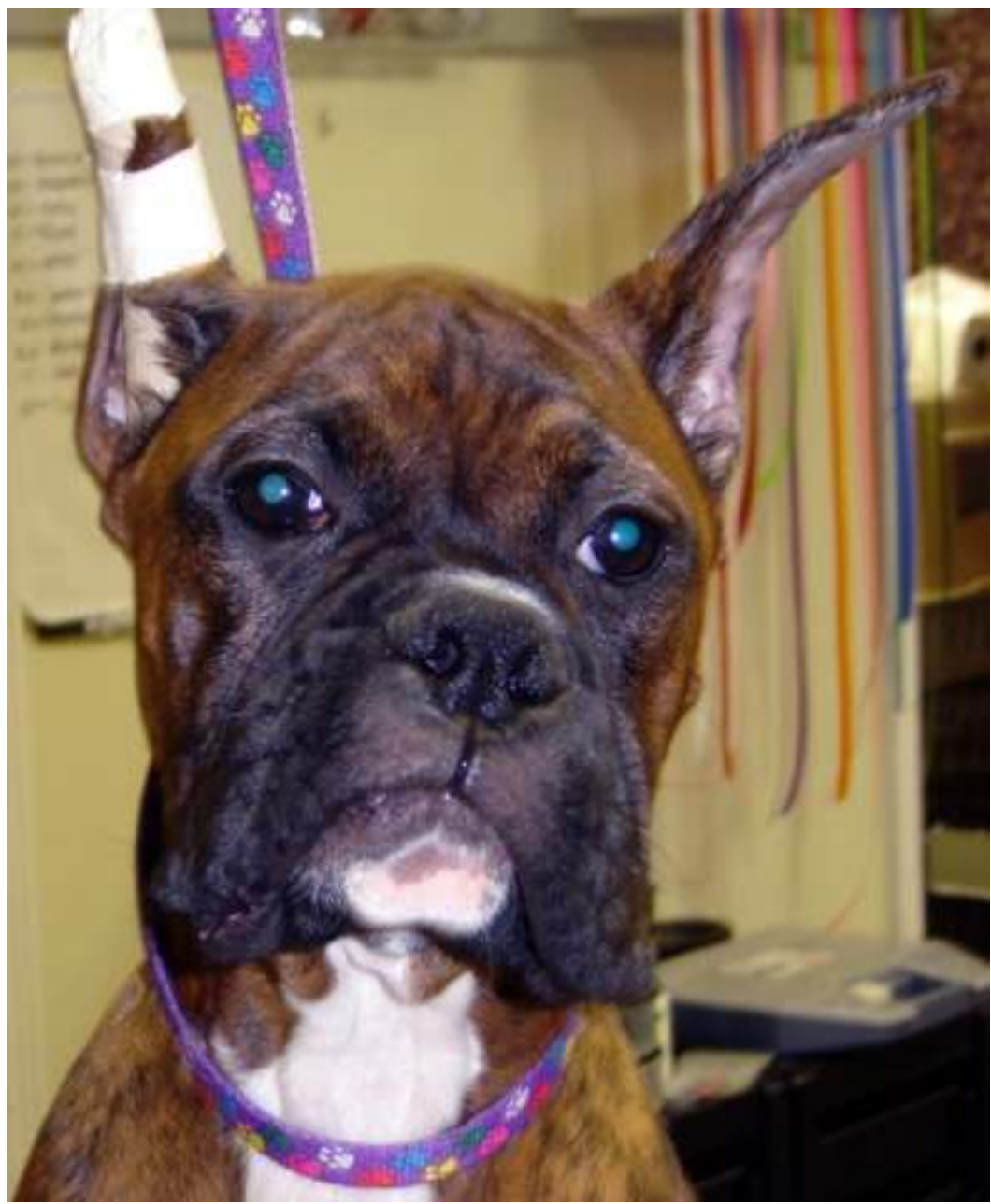
This dog got worse and has trouble eating as an adult.