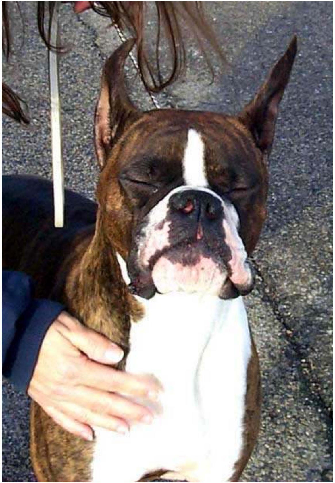
Same bitch as page 2 closeup.